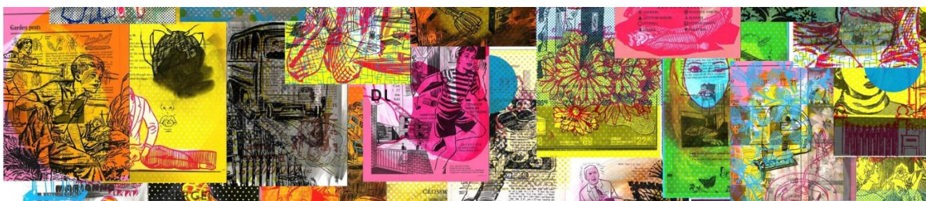
Multi-layer screenprint by Nicol Sanders-O'Shea

An exhibition of works by members of the Hāwera Art Club, including local landscapes and botanical studies.