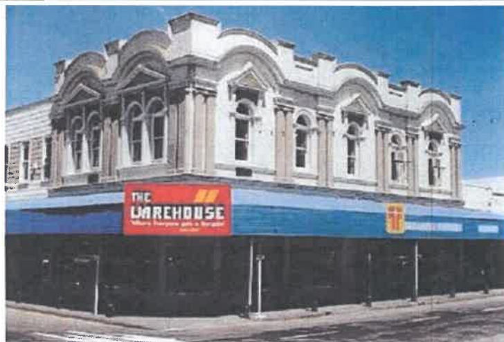
Gerrand's Watchmakers Building.