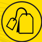
Coffee grinds and tea bags