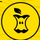
Kitchen scraps, fruit and veges

Organic Waste Up to 10% of your Greenwaste bin