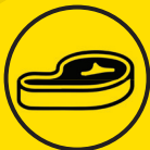
Meat, bones and fish