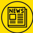
Food soiled cardboard, paper and towels, serviettes and shredded paper