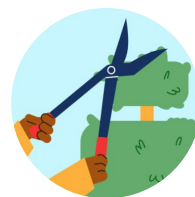
Prunings (untreated branches up to 15cm in diameter), garden waste and leaves.