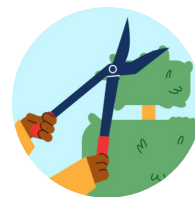
Prunings (untreated branches up to 15cm in diameter), garden waste and leaves.