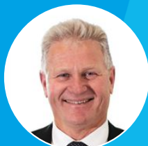
Phil Nixon Mayor