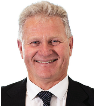
PHIL NIXON Mayor