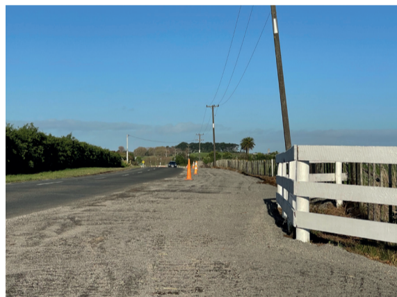
Good progress is being made on the Normanby-Hāwera pathway. The pathway, which is part of the Council's pathway programme, will run along Katermarae Road and connect with the Glover Road pathway.