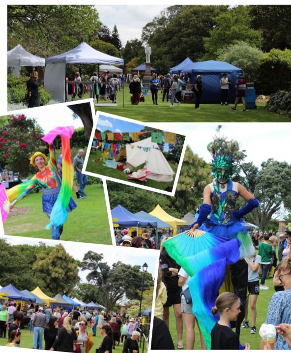
It was awesome to see so many people come along to Arts in the Park last weekend in King Edward Park, Hāwera.

"South Taranaki is on an upward trajectory. These stats show the promising potential the District has to further develop as a destination with plenty to offer domestic and international visitors," he says.