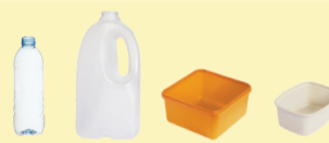
Plastic bottles, trays and containers numbered 1, 2 and 5 only

Island to be turned into new products. No recycling is sent overseas.